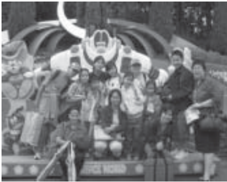
At Space World in Fukuoka

They enjoyed the rides and sights that the park offered.