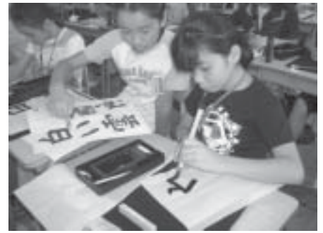
Learning calligraphy at the Kasuga-Higashi Elementary School