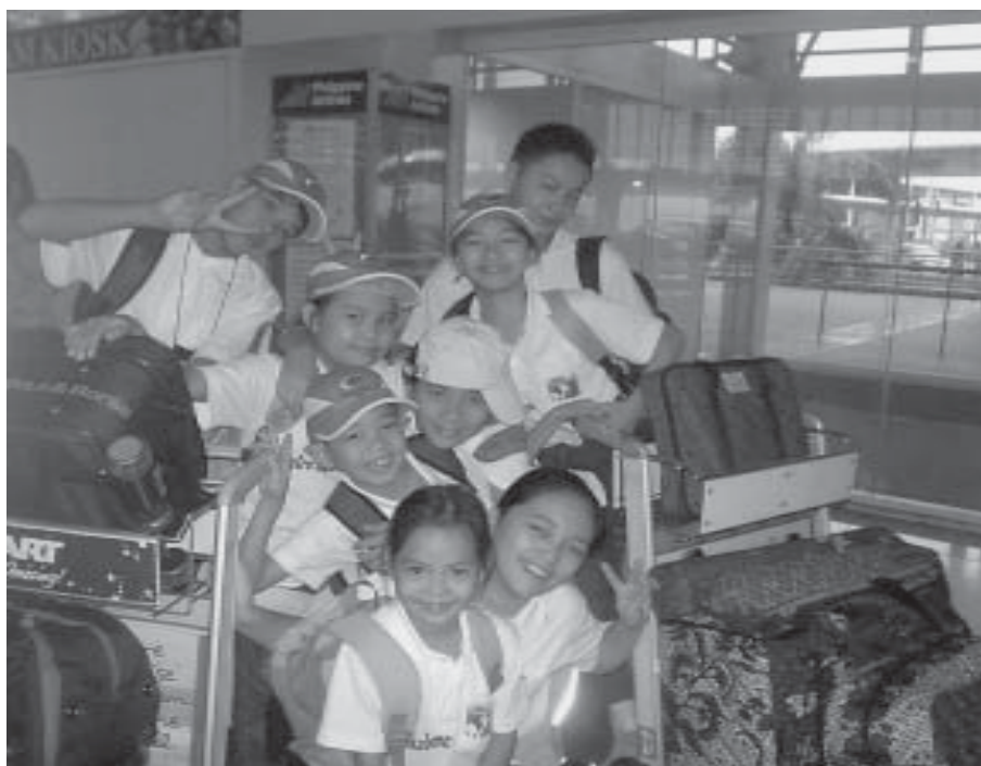
JFC participants to the Japan theater tour at the NAIA terminal 2

The first presentation of Teatro Akebono was held at the Kasuga City Hall on October 7. It was sponsored by the Asian Women Center (AWC) in Fukuoka. The performance, which was attended by the host families of the children, advocates, students, and teachers of the KHES was warmly appreciated. The Mayor of Kasuga graced the presentation and gave an