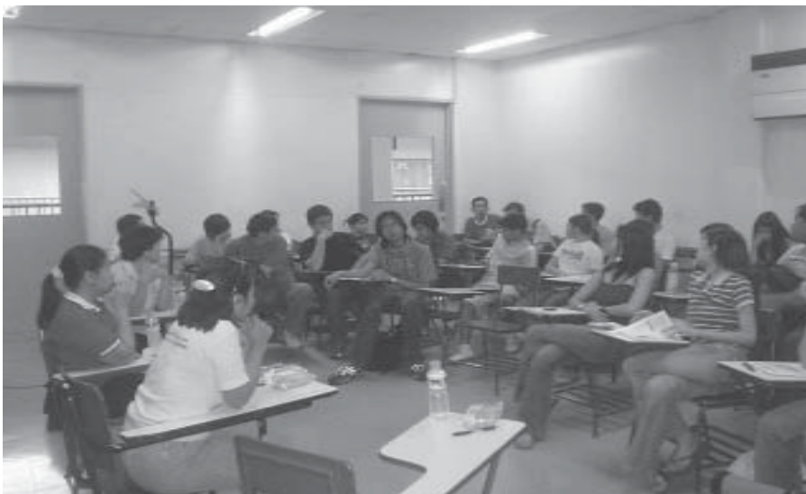
The DLSU forum