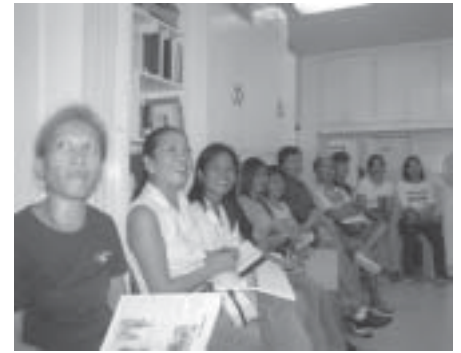
Listening during the orientation

The number of women seeking assistance from DAWN continues to increase. Almost every day, DAWN receives phone calls and e-mails from women who are looking for solutions to their problems. Most of these calls are referrals from the Japanese Embassy.