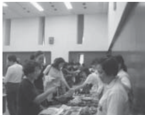
Bazaar in Yokohama