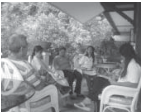
Sharing of experiences

Throughout the 3-day activity, the women members and staff of DAWN were able to share and discuss issues related to a person's development. During the focused group discussions,