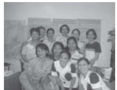
Participants of the Effective Parenting Seminar

Twelve (12) women members of DAWN participated in the said seminar. 📷