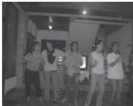
At the solidarity night