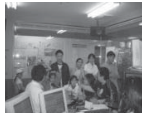
Radio guesting in Gunma