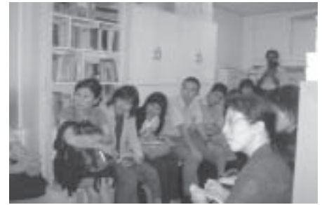
Twenty (20) Japanese participants to the Japan International Cooperation Agency (JICA) study tour visit the DAWN office on November 23. They had a briefing on the work and programs of DAWN and had an interaction with some of its women members and staff.