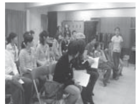
Workshop at the Shiomi church in Tokyo