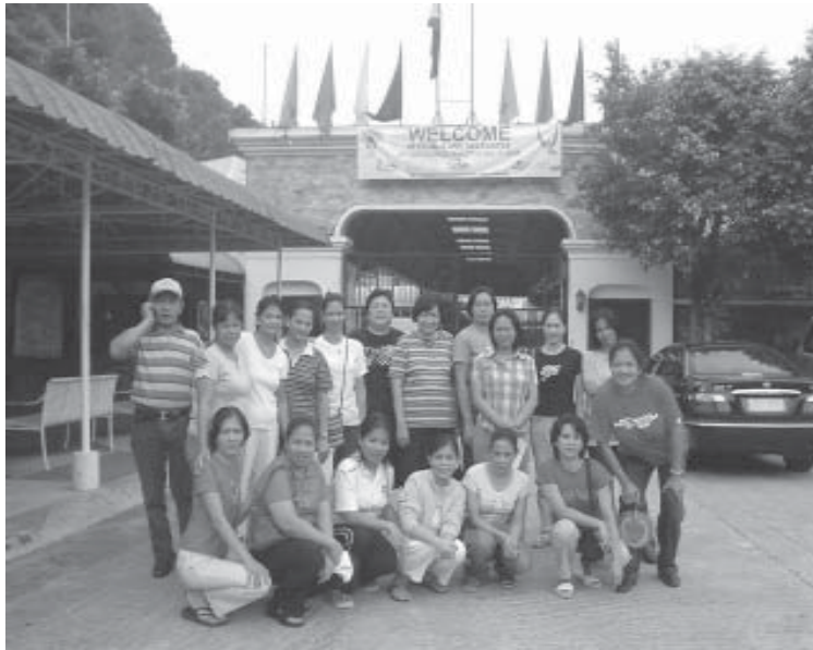
Participants in the Gender and Development Seminar

Gender, as explained in the seminar, does not only refer to an individual's sex and one's biological make up. It refers to the assessment and analysis of the social status of men and women and comprises socio-historical and ethno-cultural factors. It is a cultural concept that has an effect on all other societal roles and the social stratification of an individual.