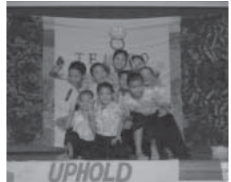
Presentation in Soka