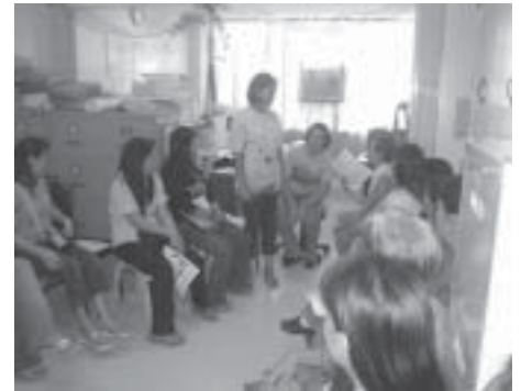
New members introducing themselves

Last November 26, twenty four (24) women and thirty-eight (38) Japanese-Filipino children (JFC) were formally welcomed as new members of DAWN through an orientation program held at the office of DAWN. The new members come from different parts of Metro Manila, Laguna, Cavite, Rizal, Pampanga, and Nueva Ecija.