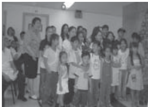
The JFC performing a number during the Christmas party

Songs and dance numbers were presented by the women and children members. Not to be outdone, the staff and volunteers also prepared song numbers. Games were also part of the program, and everyone joined in the fun. There was also an exchange gift among the JFC members that followed after the gift-giving ceremony.